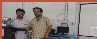
DURING THE SESSION